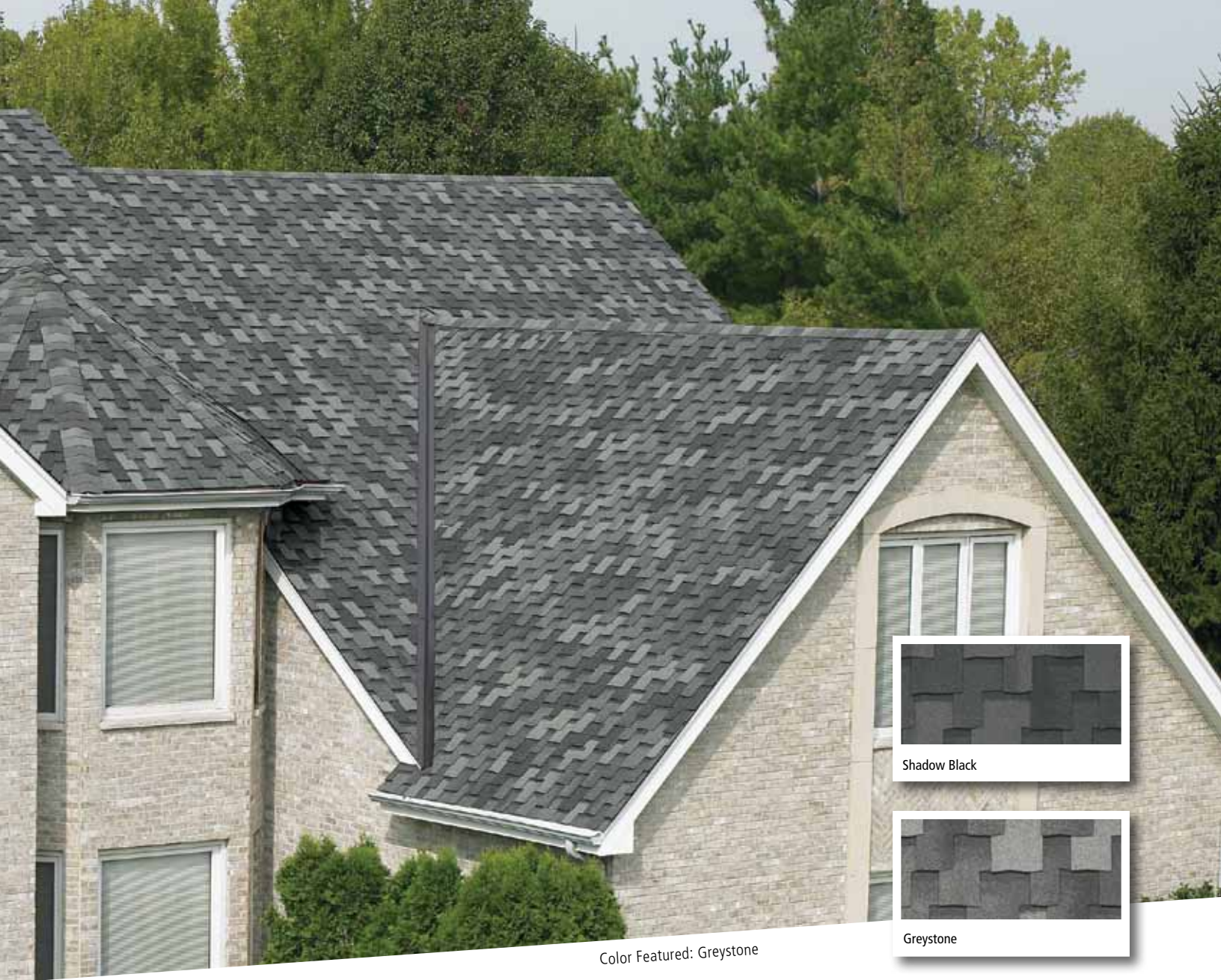
Color Featured: Greystone